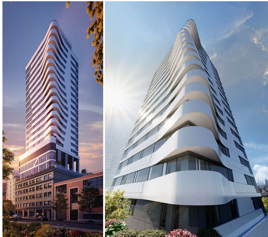
All images of Hero LIC